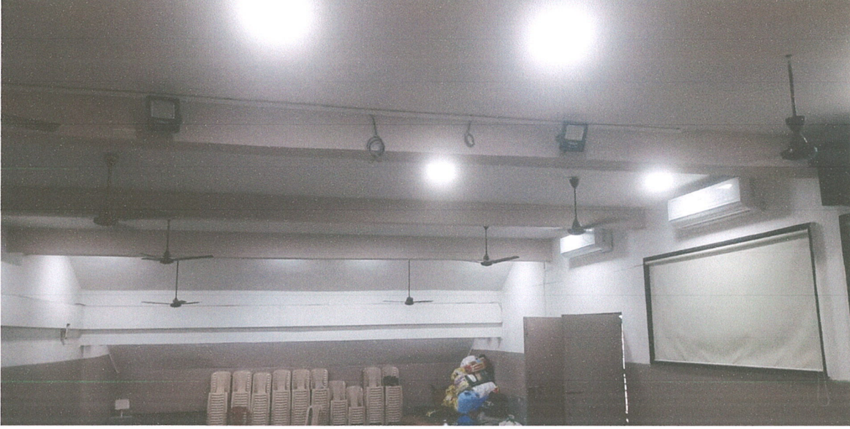
LED Halogen lights installed in Seminar Hall