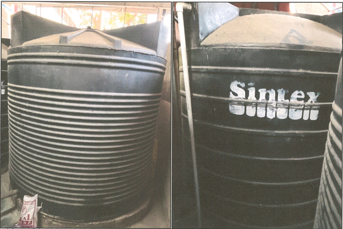
Ground Level Water Tank- 5000 litres each

Both the underground water tanks and storage tanks at the top are cleaned. Each tank takes three days to clean with water and potassium permanganate. The dirty water is thrown out and this process is repeated 2-3 times. Water tanks are unlocked only for the process of cleaning, otherwise the water tanks remain locked.