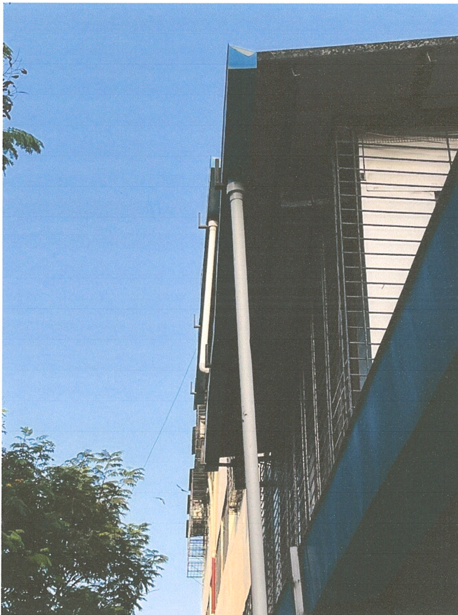
Disposal pipes starting from the roof

Tel.: 9967589008 • Email : avgcollegeoflaw@gmail.com