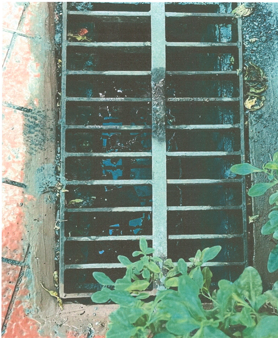
Thane Municipal Corporation Storm Water Drainage line

Tel.: 9967589008 • Email : avgcollegeoflaw@gmail.com