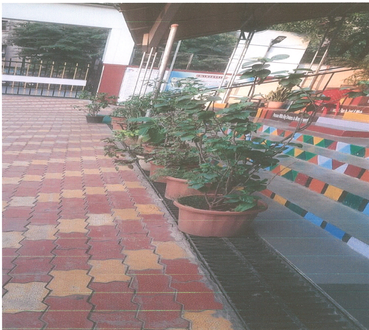
Indoor plants in the entry passage to the canteens

Anand Vishwa Gurukul College of Law campus is constrained for space hence we have planted more indoor plants which enhances the quality of indoor air by filtering and purifying it. Indoor plants contribute to a sense of well-being and improve mental health.