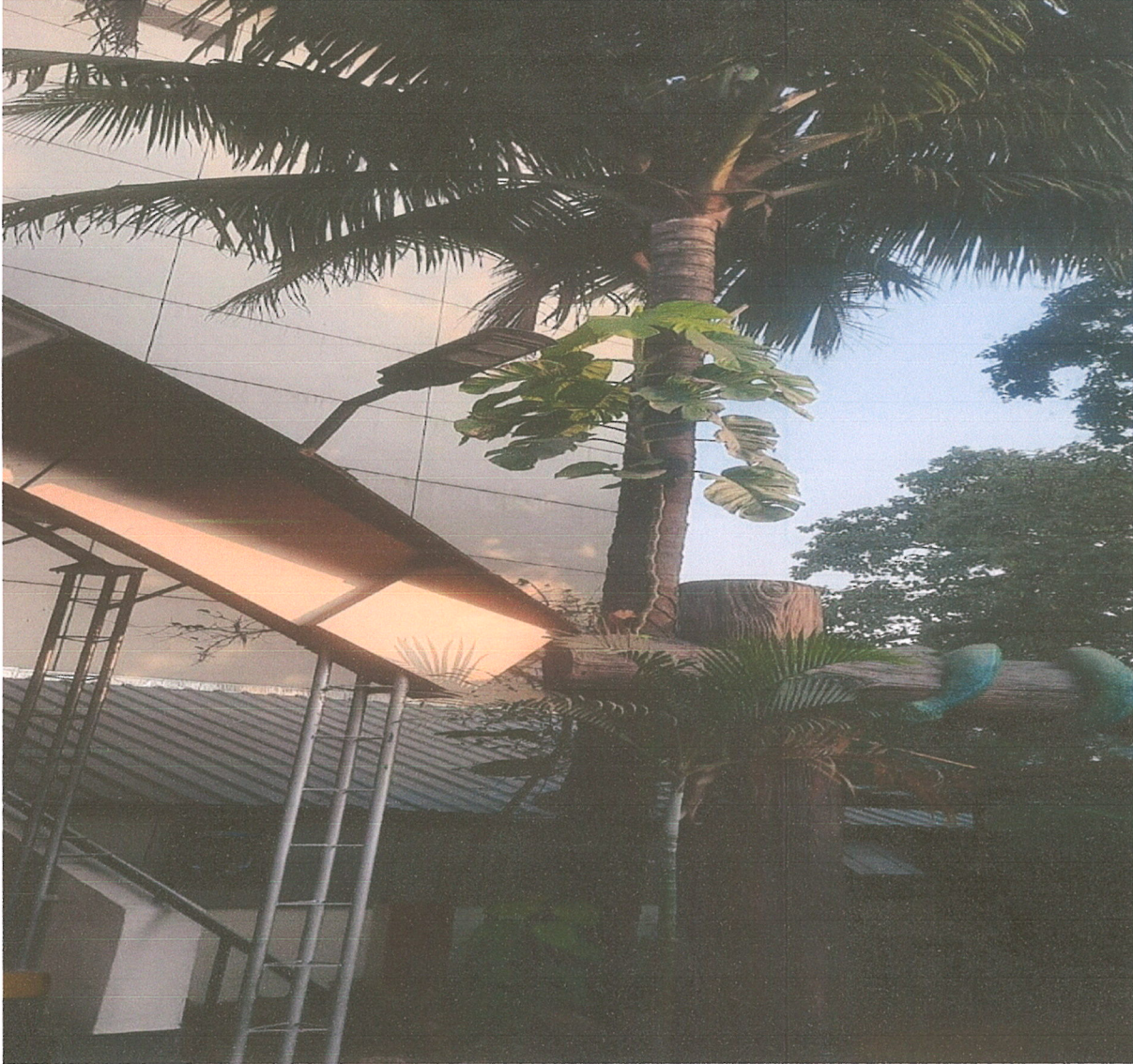
Coconut Tree on the College Campus

Tel.: 9967589008 • Email : avgcollegeoflaw@gmail.com