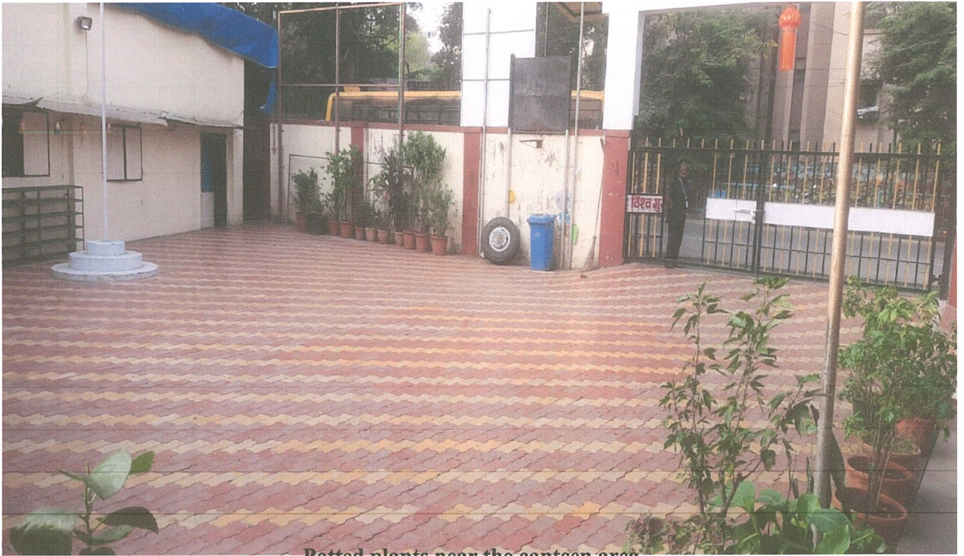
Potted plants near the canteen area

Tel.: 9967589008 • Email : avgcollegeoflaw@gmail.com